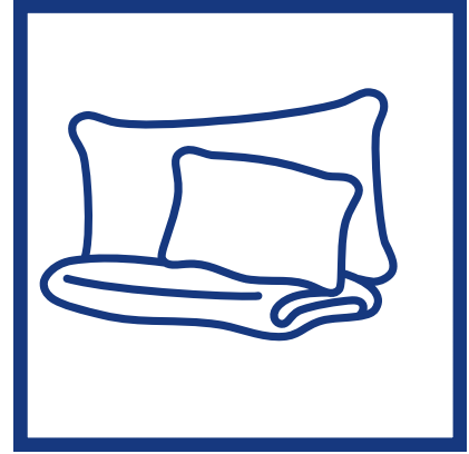
remove bed linen